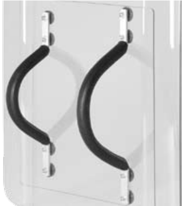
S-Type Handles These are our specialist large loop handles for our medium to small Armadillo shields.