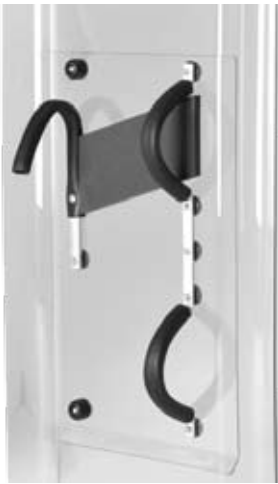
Dolly & Brolley Handles These are our standard handles on our larger Armadillo shields.