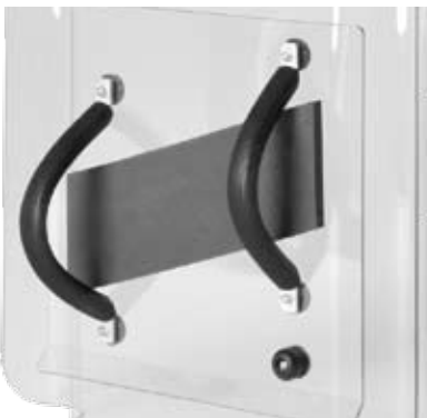
D-Type Handles These are our standard handles on our smaller Armadillo shields.