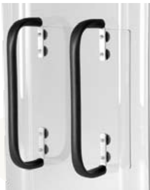
C & R Handles These handles were designed for Control & Restraint purposes for medium to large shields used in restricted spaces.