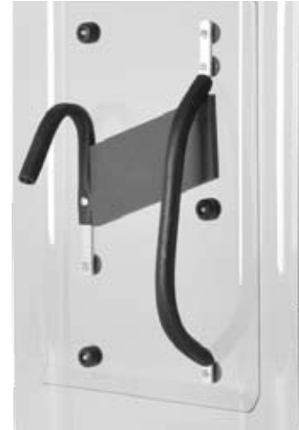
C-Type Handles Offer the user a similar holding position as the Dolly & Brolley but is more compact for rapid deployment.