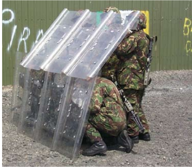
Our patented interlocking design offers unmatched protection in any kind of public order incident

For the user, the unique and patented interlocking feature of the Armadillo Shield is one of the many reasons why they are popular the world over. Based on an Ancient Roman design, the Armadillo allows the user to remain protected by interlinking the shield's bevelled edges with other shields to form a protective and ridged barrier from harm.