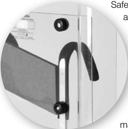
Protective rubber buffers, for improved rioter and public safety

Safety of the rioter is also an important concern, therefore, all of our shields are fitted with rubber buffers, which mask all anteriorly placed bolt heads for improved public safety.